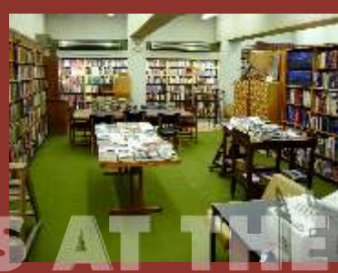
Library Facility at BMI