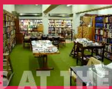
Library Facility at BMI